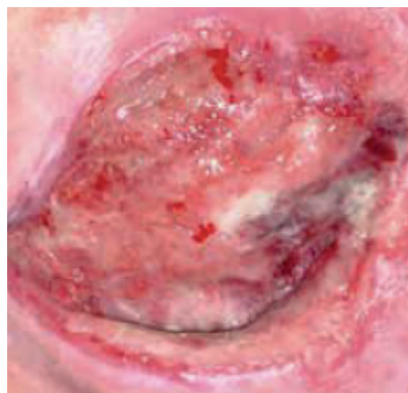
Fig 1. Sacral Pressure Ulcer before treatment

Such extensive vascular disease resulted in a mid-thigh amputation of the left leg.