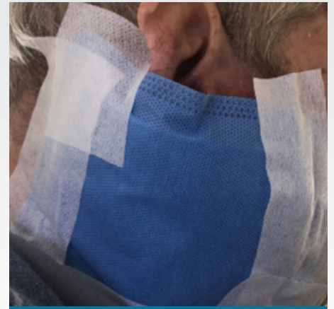
Fig 2. ConvaMax™ dressing in situ