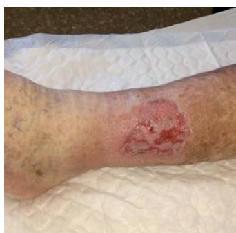
Fig 1. Injuries on the inside and outside of the left foot