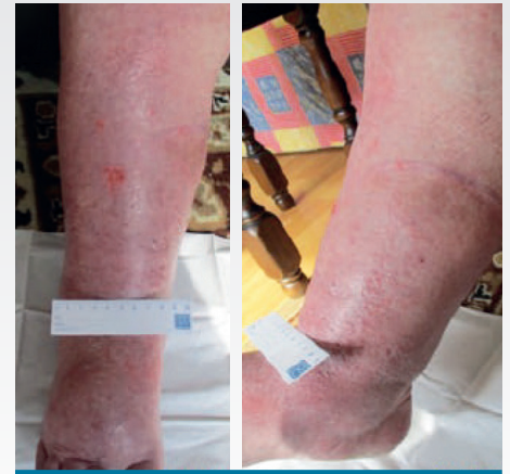
Fig 2. ConvaMax™ dressing in situ

After 7 days the dressing regime was stepped down to AQUACEL® Foam Non Adhesive 10cm x 10cm dressing to cover the open wound area to anterior leg only. From this point, dressing changes were reduced to once weekly with complete healing achieved in 2 weeks.