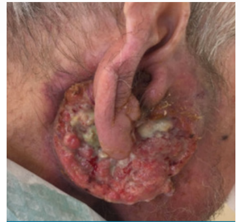
Fig 3. Wound 3 weeks post application of ConvaMax™ dressing