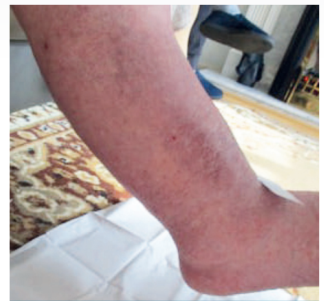
Fig 3. After 7 days treatment with ConvaMax™ Superabsorber and AQUACEL® Ag+ Extra dressings

“ ConvaMax™ dressing managed the exudate better than Zetuvit® plus for this patient which improved the condition of surrounding skin. ”