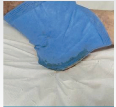
Fig 2. ConvaMax™ dressing in situ