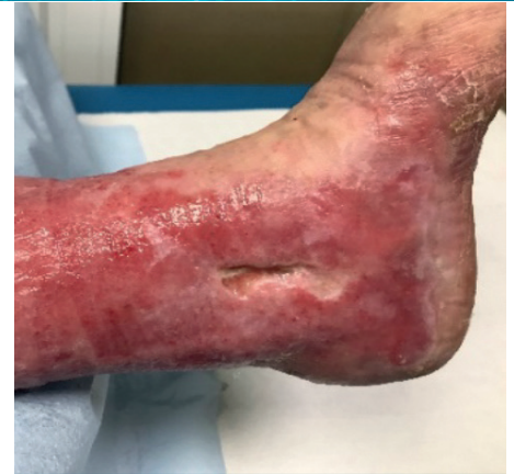
Fig 1. Wound prior to ConvaMax™ treatment