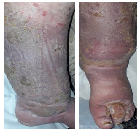
Fig 3. After 4 weeks of ConvaMax™ Superabsorber dressing visits were now reduced to twice a week