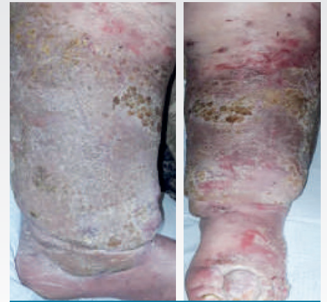
Fig 2. After 1 week of new dressing regime of ConvaMax™ Superabsorber and AQUACEL® Extra™ between toes the visits had reduced to alternate or every 3rd day

ConvaMax™ Superabsorber dressings were considered more effective in managing the exudate than the previous regime. The patient commented that the new dressings were more comfortable and the new dressings didn't swell and drop down as the others often did.