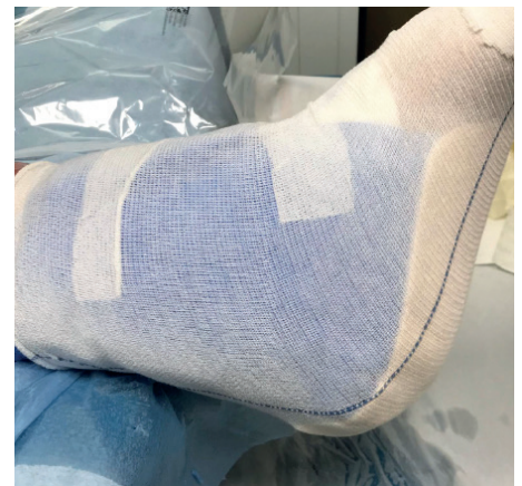
Fig 2. ConvaMax™ dressing in situ on 1st application