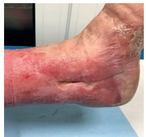
Fig 3. Wound 7 days after the start of AQUACEL® Extra™ dressing and ConvaMax™ dressing regime