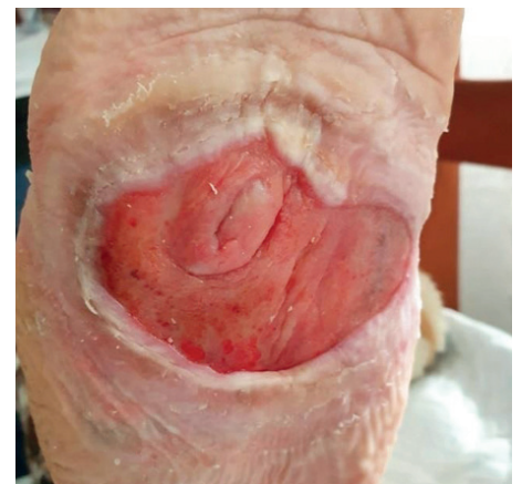
Fig 4. After 20 weeks of ConvaMax™ treatment

“ Good management of the exudate has been crucial to achieve quality of life for the patient. ”