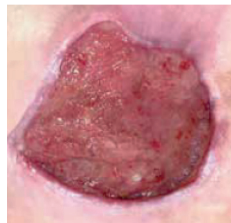
Fig 4. Notable reduction in wound depth and evidence of healthy granulation tissue on the wound bed.