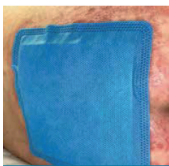
Fig 2. Application of ConvaMax™ Superabsorber dressing in combination with hyghtec® stool drain to prevent undermining by thin stool.