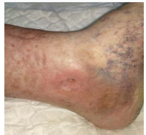
Fig 3. After ConvaMax™ treatment t (8 weeks duration)