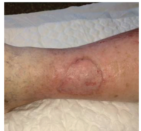
Fig 4. After ConvaMax™ treatment (8 weeks duration)