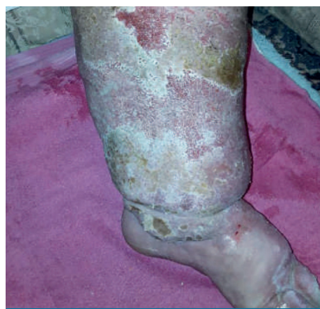
Fig 1. Right leg before treatment

This 64-year-old lady with slightly restricted mobility first presented on the district nurse case load with leg swelling, redness, and small wounds to the right leg 12 months ago. Since then, despite compression bandages the ulcers to the leg have deteriorated and four separate courses of antibiotics were required. For just over 12 months this lady has received daily visits using a wealth of different primary dressings including prolonged periods of antimicrobial products as well as conventional dressings.