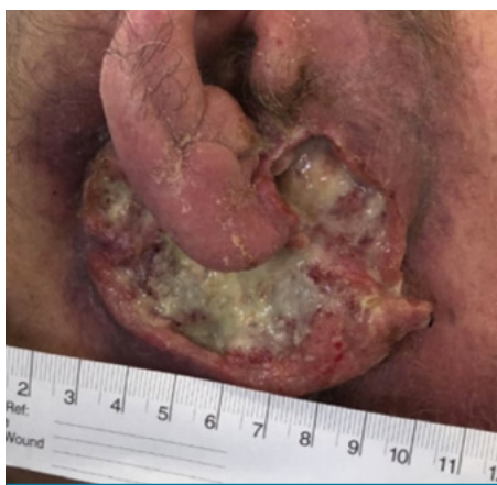
Fig 1. Wound on presentation

The number and duration of the dressing changes started to become exhausting for Mr. E and challenging for the Practice Nurses to maintain. As a result the District Nurses were asked to help, even though he didn't fit the home needs assessment criteria.