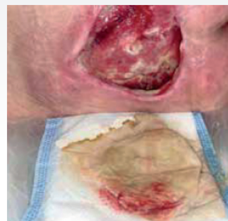
Fig 3. AQUACEL® Extra™ dressing was used in combination with ConvaMax™ Superabsorber for 14 days.

Through simultaneous sanitation of the Clostridium difficile and the surgical debridement, two factors that considerably limited the patient's quality of life could be eliminated. The superabsorbent ConvaMax™ dressing ensured very good exudate management in both parts of the therapy and thus supported positive wound progression and economic wound management.