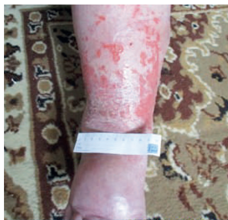
Fig 1. Right leg before treatment

This 76 year old lady was receiving treatment at home from the community nurses. Community nurses had been visiting this lady for the past 3 weeks to treat open wounds and manage the leg oedema. This lady originally presented with an extensive area of contact dermatitis to the gaiter region of the leg and small ulcer to the anterior aspect of the leg. Dressing changes had been taking place 3 x weekly with the dressing changes taking approximately 1 hour. The wound remained static, despite use of topical steroid therapy and compression hosiery, as exudate management was an issue.