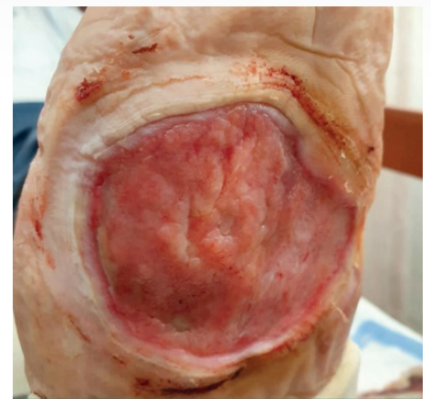
Fig 3. After 12 weeks of ConvaMax™ treatment