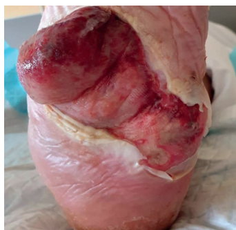
Fig 1. Wound prior to tissue mass removal