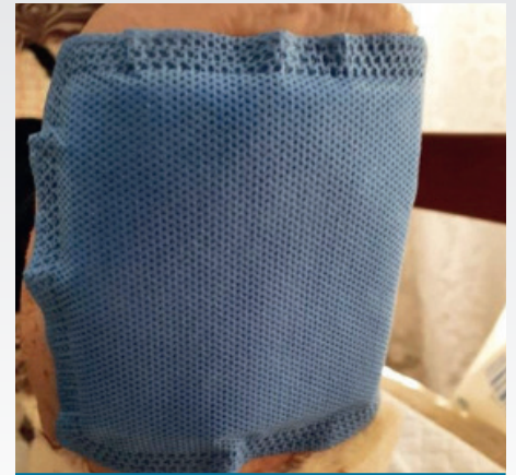
Fig 2. ConvaMax™ dressing change every 48-72 hours